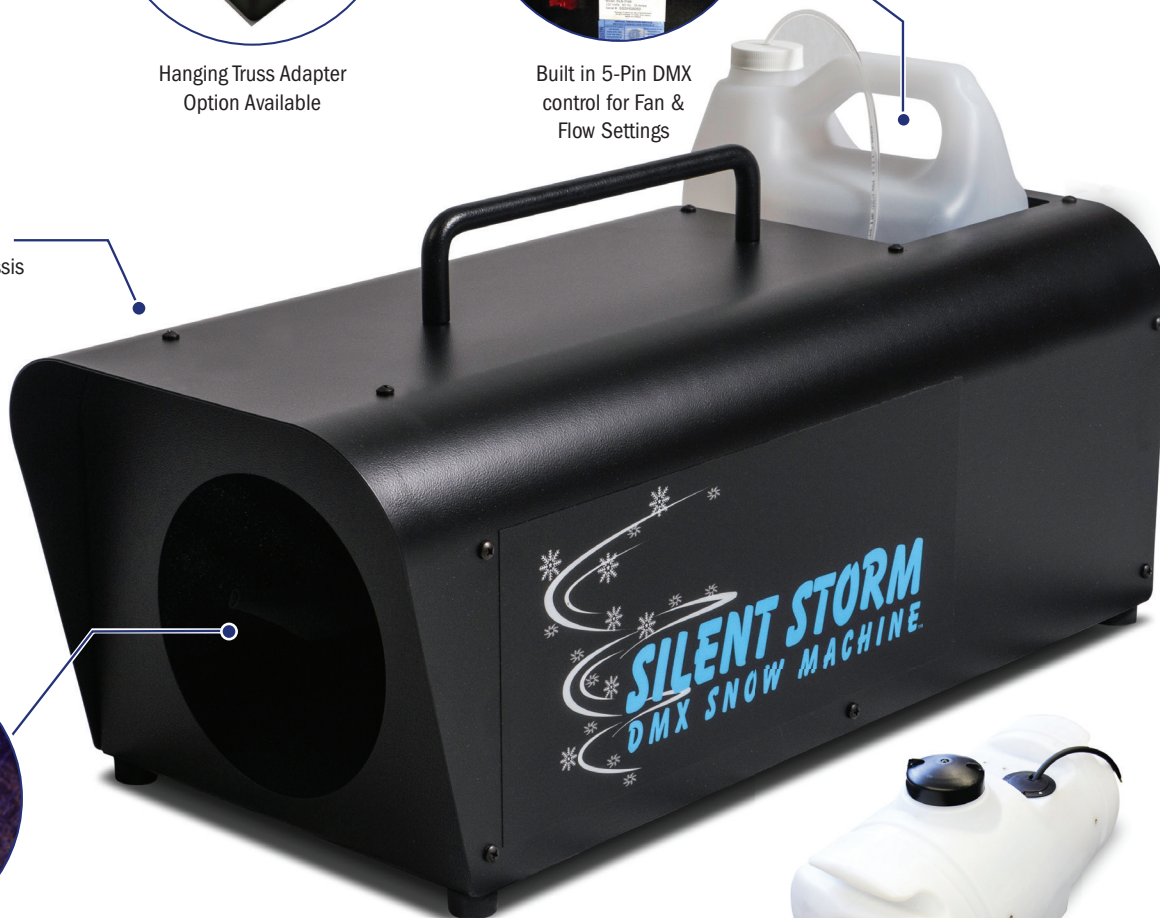
Fluid Distribution System (FDS) available (25 gallon tank shown)