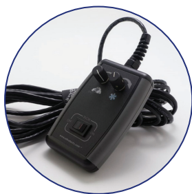
Variable Output, Timer Remote Included