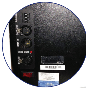
Built in 5-Pin DMX control for Fan & Flow Settings