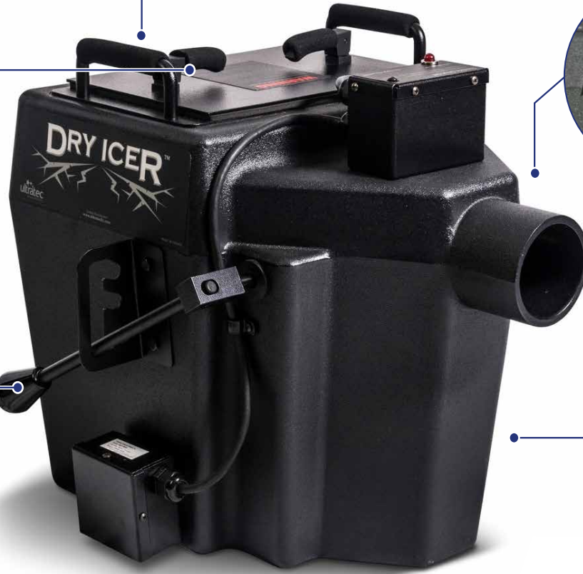
3 Step Pivoting Ratchet System