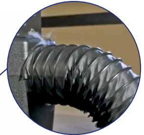
4" Hose Adaptor (can be used with optional 25 ft. flex hose)