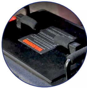
Heavy Duty Latches