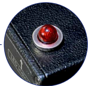
Low Water Shutoff Indicator