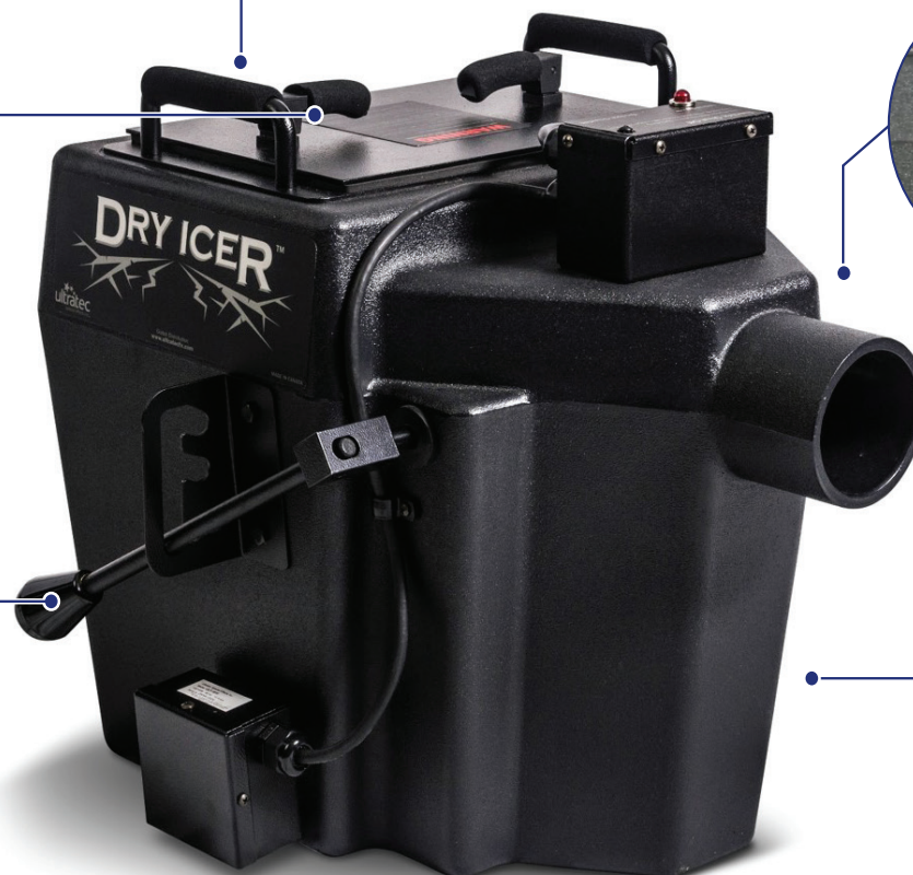
3 Step Pivoting Ratchet System