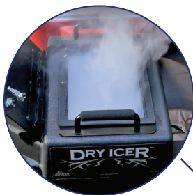
20 lb Dry Ice Capacity