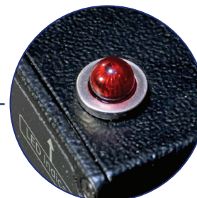
Low Water Shutoff Indicator