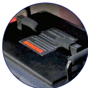
Heavy Duty Latches