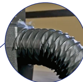
4" Hose Adaptor (can be used with optional 25 ft. flex hose)