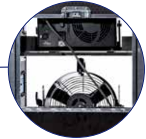
Access panel on the back of wheeled road case

Note: Radiance Arena System ships with 5-pin DMX cables installed & daisy chained for quick & easy setup