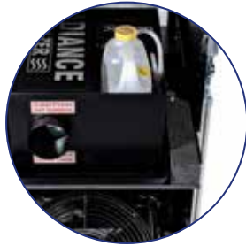
Radiance Hazer tray slides out for easy access