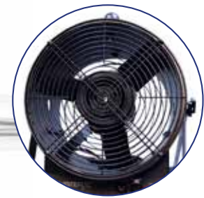
1,500 CFM at 2,750 FPM at full speed output