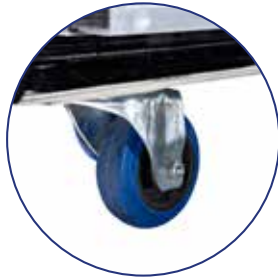
Fifth wheel under the fan tray provides full support