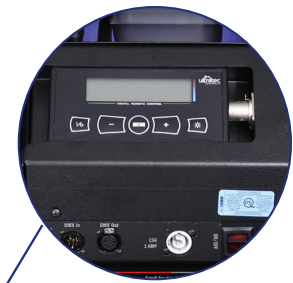
Built in 5-Pin DMX control or manual control via backlit digital interface