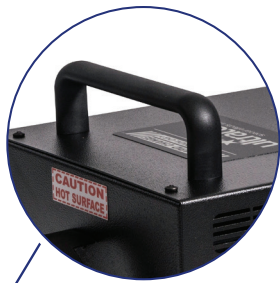
Heavy-duty comfortable handles