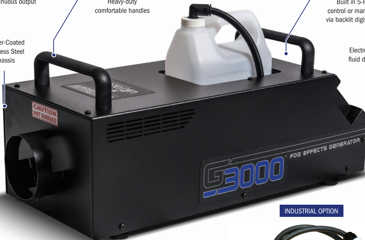
Electronic low fluid detection