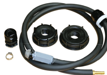
Industrial hose option for continuous heavy use