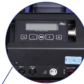
Built in 5-Pin DMX control or manual control via backlit digital interface