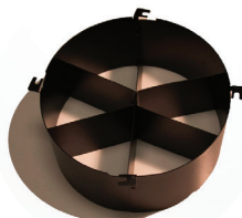
Versa Focus (not included)