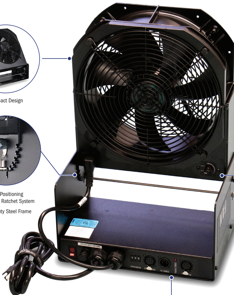
Optional Built in 5-Pin DMX Control (version shown) or Manual Control