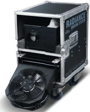
Versa Fan Built into the Touring System