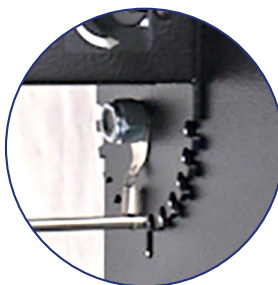
Easy Positioning w/ Built-in Ratchet System Heavy-Duty Steel Frame