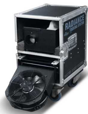
Versa Fan Built into the Touring System