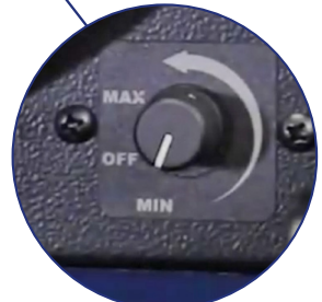
Built-In Variable Speed Control