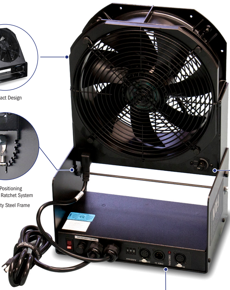
Optional Built in 5-Pin DMX Control (version shown) or Manual Control