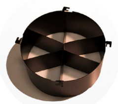
Versa Focus (not included)