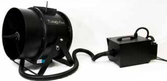
Snow Machine Attachment for Turbo Fan